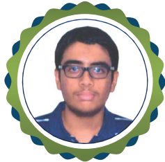
Atharva Paradkar College: R.A.Podar