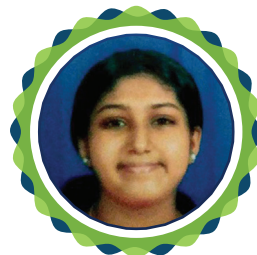
Ann Kadantot School: Auxilium