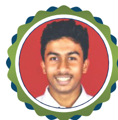
Sumedh Suradkar College: R.A.Podar