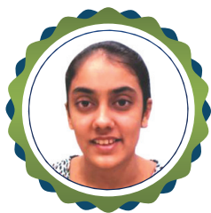
Jannat Gandhi College: K.C.