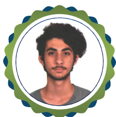
Shahzad Tata College: R.A.Podar