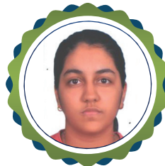
Palomi Chaturvedi College: Jai Hind